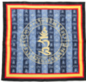
Dependant Arising Scarf $86.80